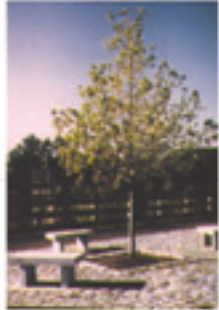
SQUARE BENCHES 26