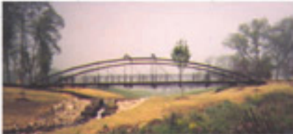
SQUARE WHIRLE BOW STRING TRUSS BRIDGE, BUILT IN 1872, RENOVATED 1998. INSTALLED AT THE NEWARK CAMPUS. 26