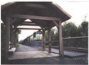
COVERED BRIDGE AT LAMB LANE 26

NEWARK TRAIL DETAILS - SEE OPPOSITE SIDE