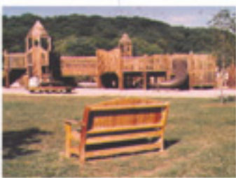
WISWOOD PARK 26