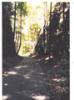
THE DEEP CUT BACKHAND GORGE 26