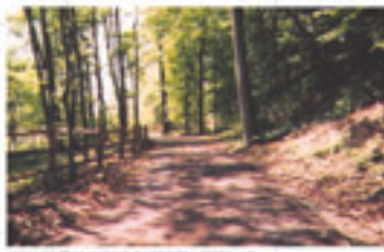
VIEW OF TRAIL ALONG SACCONN CREEK 17