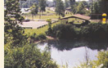
The T.J. Evans Family Park N17-B