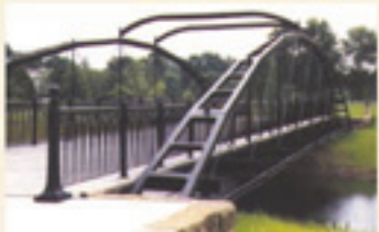
The Square Whipple Bow String Truss Bridge N12-H