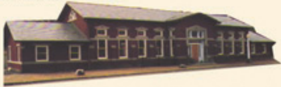
Built in 1880 for the P.C. & O. R.R. and nicknamed the "Pan Handle Depot", this historic railroad station, more accurately referred to as "Pennsylvania Station" serves as offices for The Evans Foundation as well as other community service organizations. N23-O

Many thanks to the Licking County Commission, the Ohio Department of Transportation, the municipalities of Johnstown, Alessandro, Greenville, Newark, and Harmer, and Friends of the Bike Trail for their support.